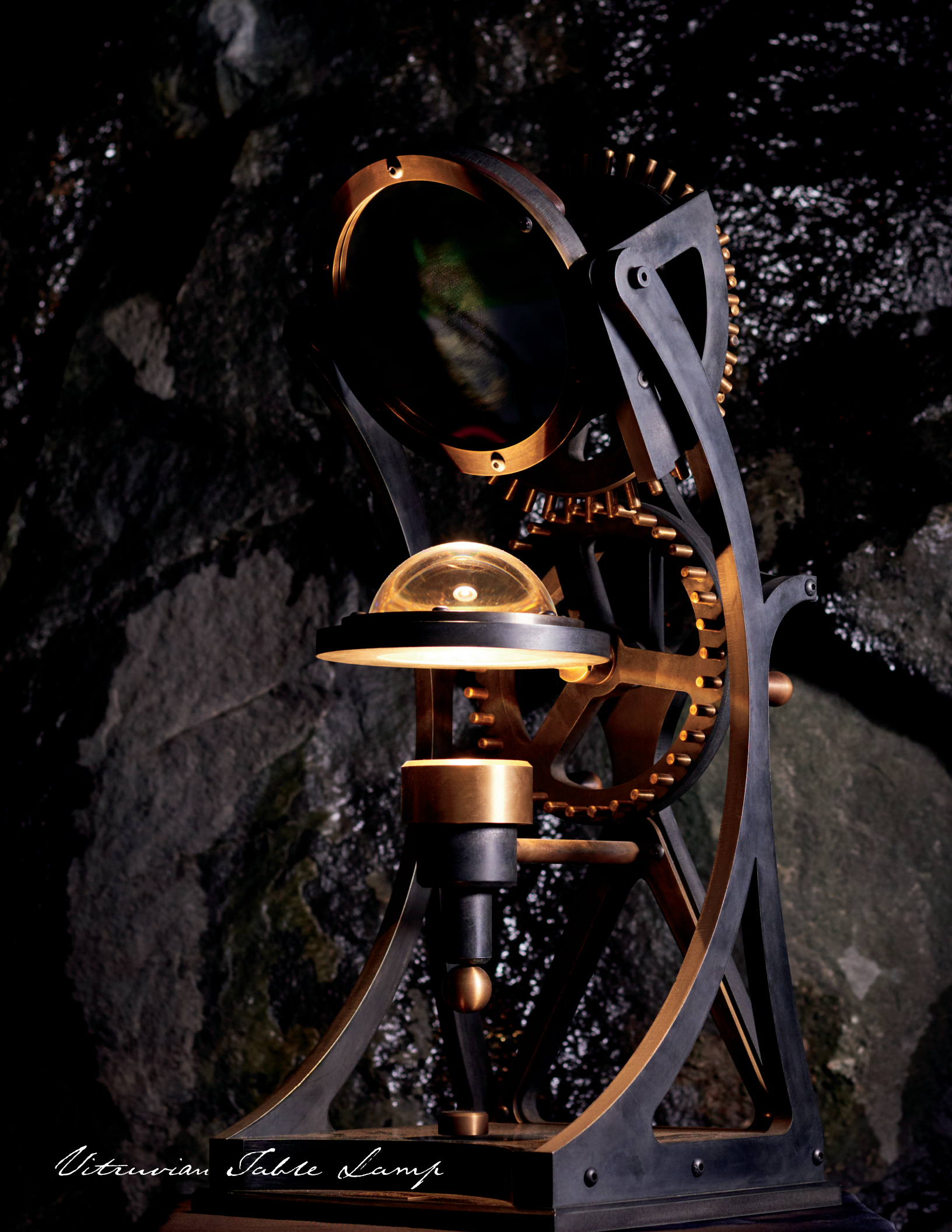
Vitruvian Table Lamp