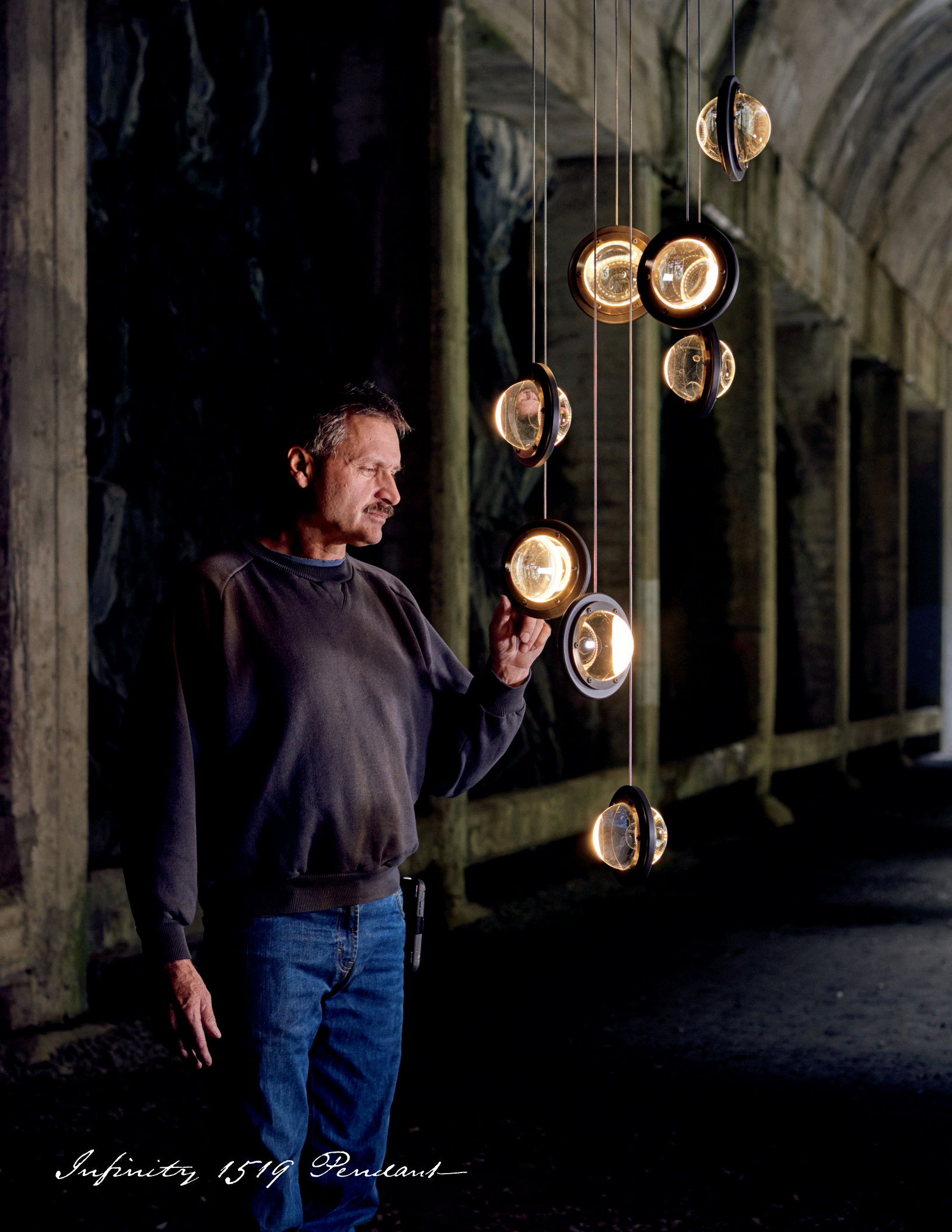
Infinity 1519 Pendant