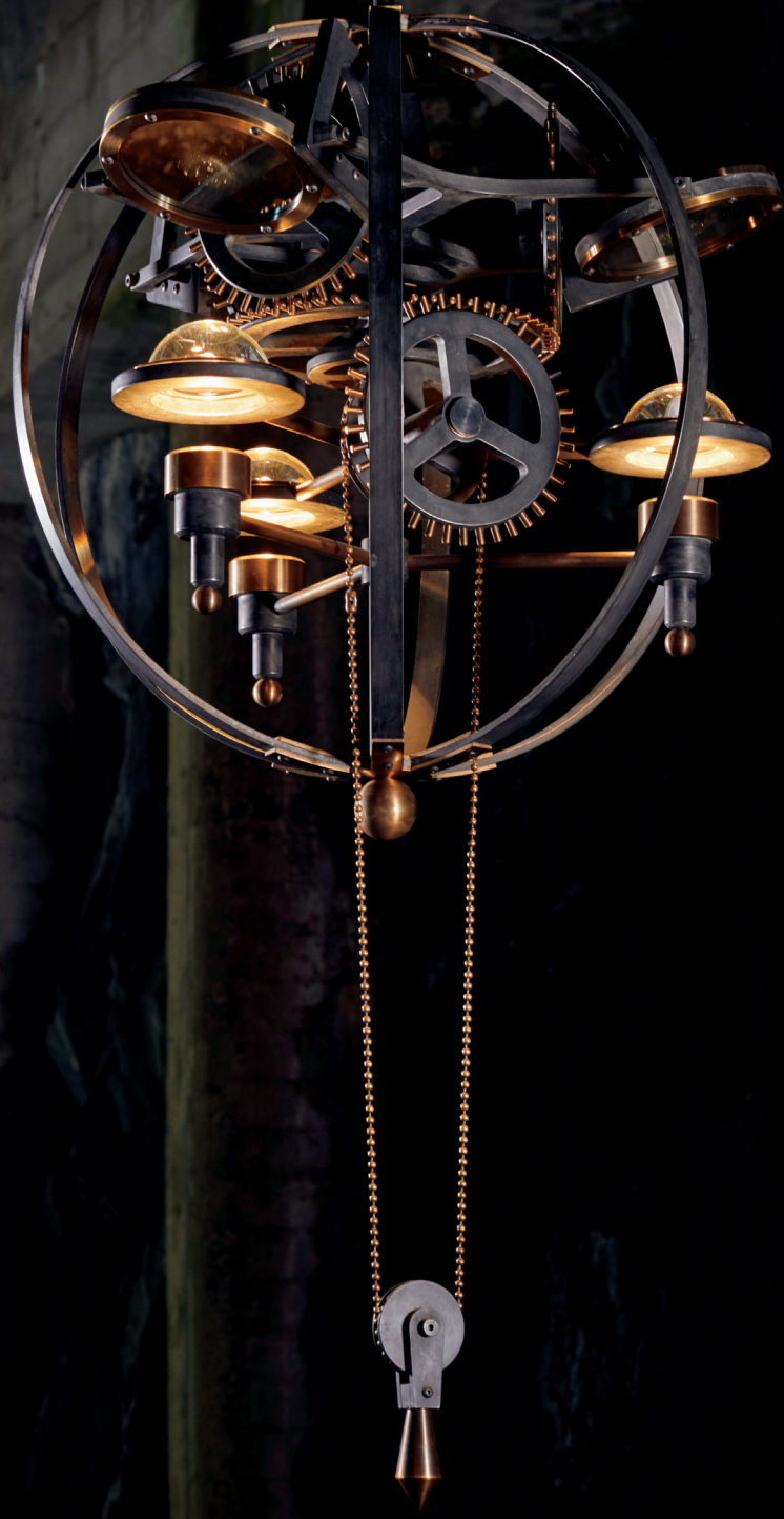
Leonardo 1482 Chandelier